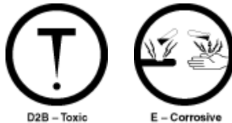
D2B - Toxic