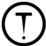
D2B - Toxic

D2B - Poisonous and infectious material - Other effects - Toxic