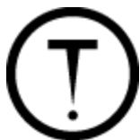
D2B - Toxic

D2B - Poisonous and infectious material - Other effects - Toxic