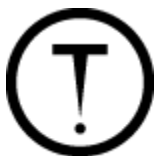
D2B - Toxic

D2B - Poisonous and infectious material - Other effects - Toxic