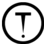
D2B - Toxic

D2B - Poisonous and infectious material - Other effects - Toxic