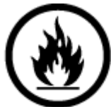
B3 – Combustible Liquid