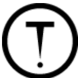
D2B – Toxic

B3 – Flammable and combustible material – Combustible liquid