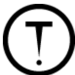
D2B - Toxic

D2B - Poisonous and infectious material - Other effects - Toxic