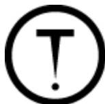
D2B – Toxic