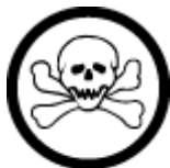
D1A – Very Toxic