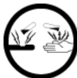
E – Corrosive