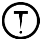
D2A - Very Toxic

D2A - Poisonous and infectious material - Other effects - Very toxic