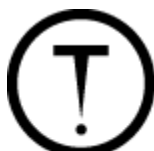
D2B - Toxic