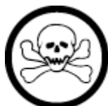
D1B - Toxic