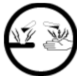
E - Corrosive