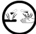
E - Corrosive

WHMIS Health Effects Criteria Met by this Chemical: