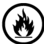
B3 - Combustible Liquid