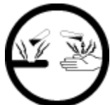
E – Corrosive