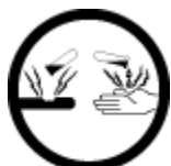
E – Corrosive