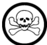
D1A – Very Toxic