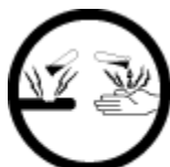
E – Corrosive