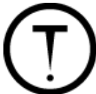
D2A – Very Toxic

D2A – Poisonous and infectious material – Other effects – Very toxic