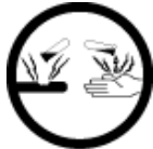
E – Corrosive