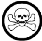
D1A – Very Toxic