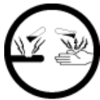
E - Corrosive